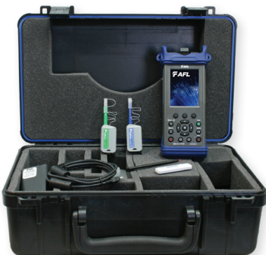
M310 OTDR in Hard Transit Case