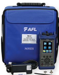
M310 OTDR in Soft Case