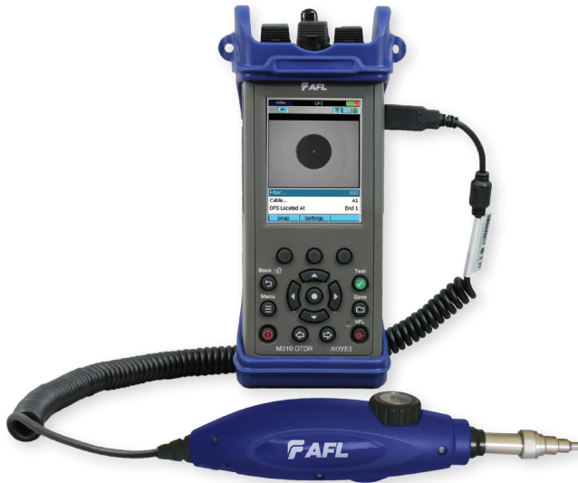
M310 OTDR with DFS1 Digital FiberScope