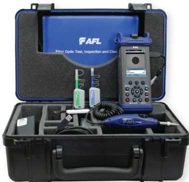
M310 QUAD Test and Inspection Kit (Tier 2)