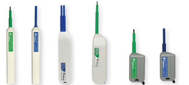
SC, ST, FC LC/MU D-LC Ultra 2.5 Mini-100 SC, ST, FC, LC/MU One-Click Cleaner Series