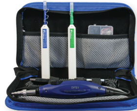
DFS1 FiberScope Inspection Kit