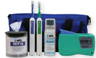
FCP2-00-0900 Basic Cleaning Kit