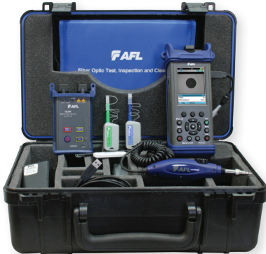
M310 QUAD Certification Kit (Tier 1 and Tier 2)